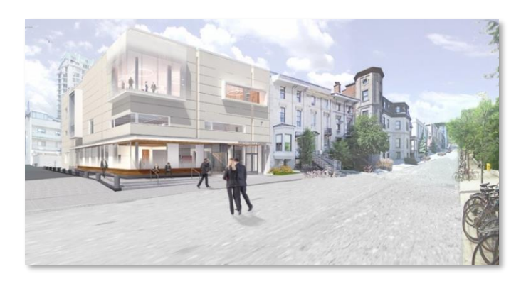
New MBA Building Coming Soon!

The Desautels Faculty of Management is excited to announce a brand new building for our MBA and specialized Masters programs! The building is adjacent to our current location on the lower downtown campus. Work has already begun on the new building and we expect to be operational in January 2018.