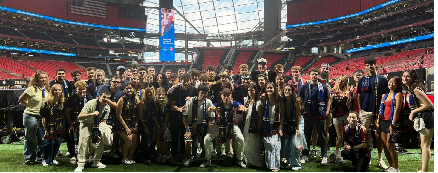
Emory Inbound BBA Exchange Class Fall '25