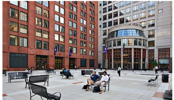
The Kaufman Management Center at NYU Stern