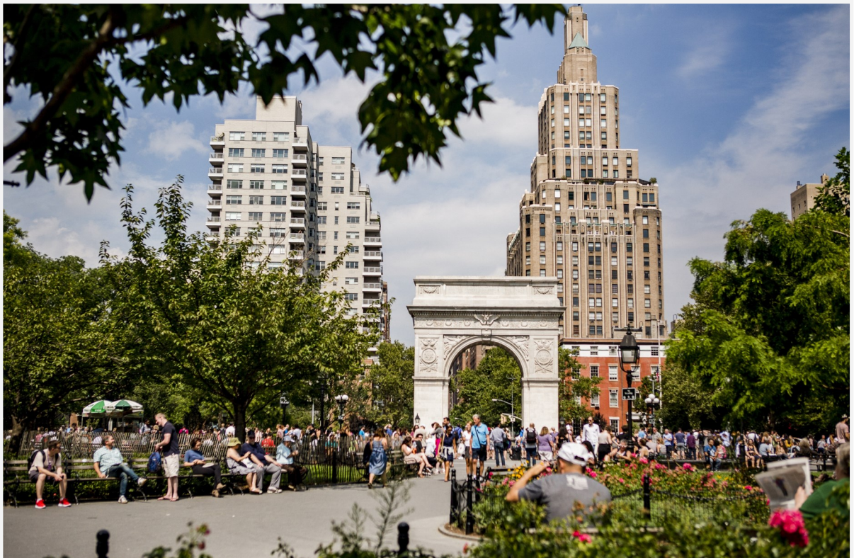
Washington Square Park

There are 60-70 students in most MBA electives.