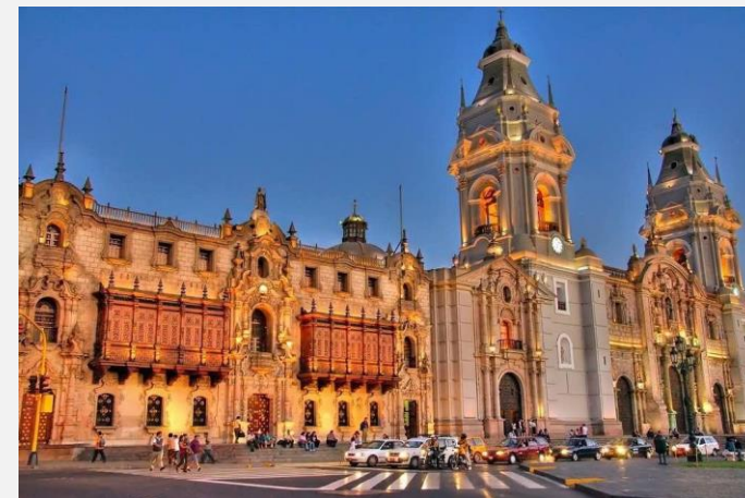
The Cathedral of Lima