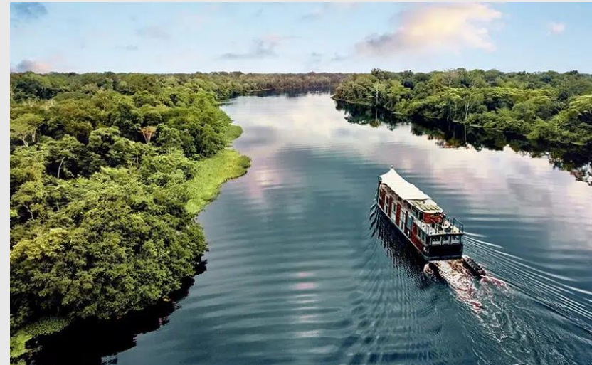
Amazonia (Iquitos region)