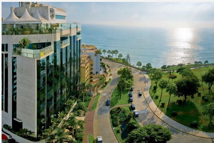
Miraflores Park Hotel